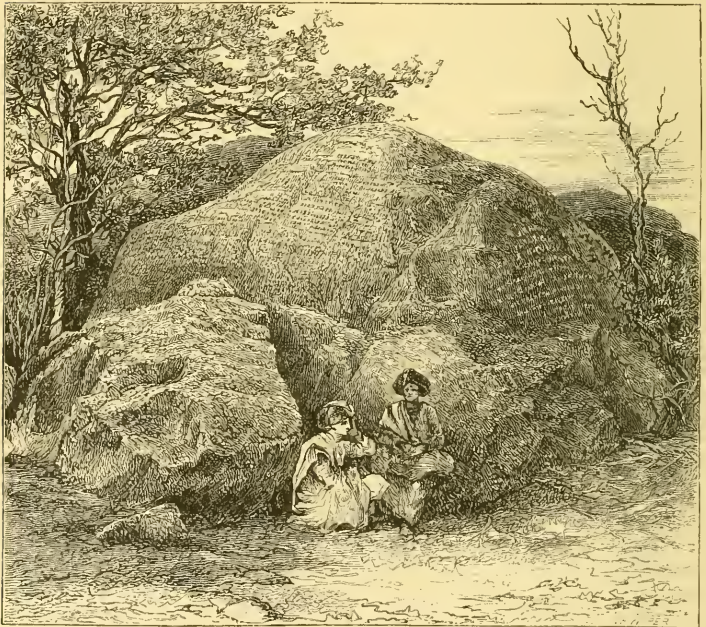
THE GIRNAR ROCK.